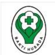
Ministry of Health